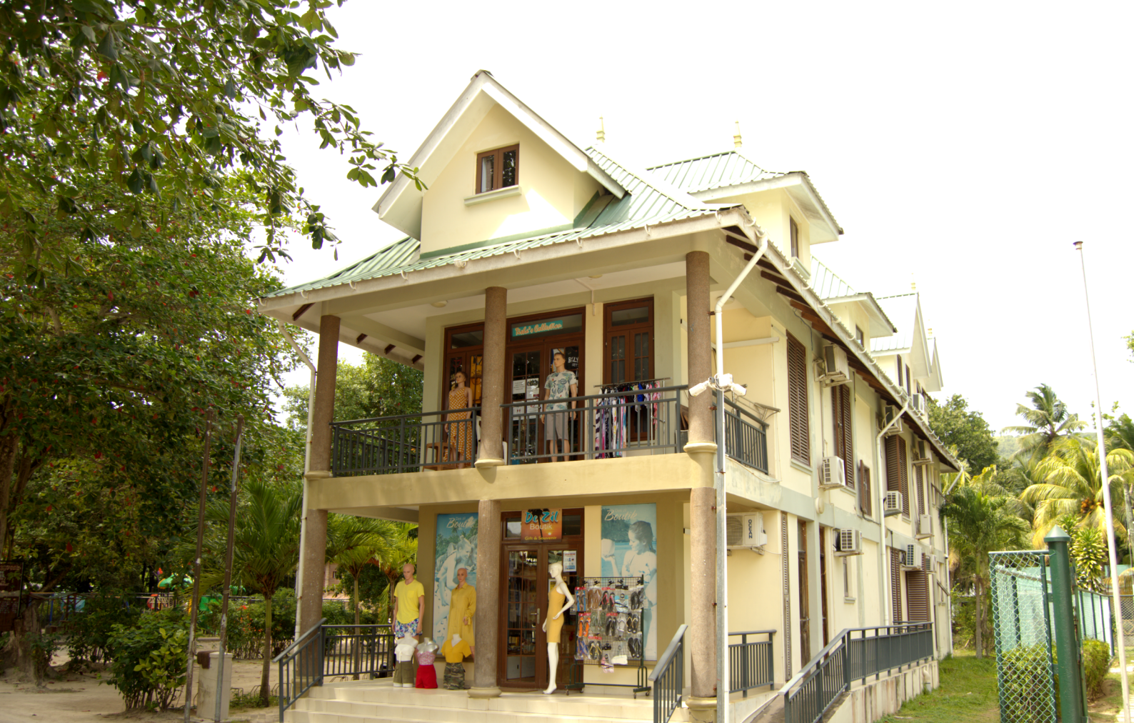
La Passe Pension House